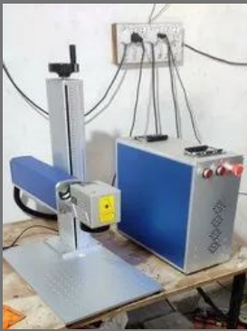
Metal Laser Marking Machine