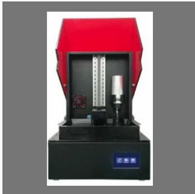
SLA 3D Printer