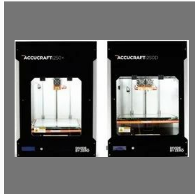
FDM 3D Printing Machine