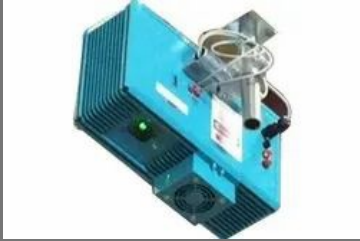
Industrial Laser Machine