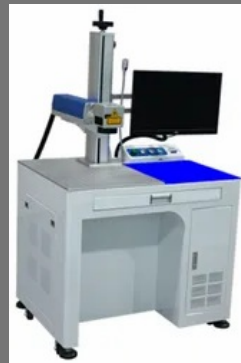
Split Laser Marking Machine